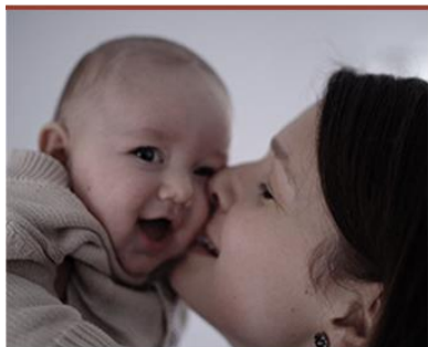
#GivingTuesday is a global day of giving observed on the Tuesday following Thanksgiving (in the U.S.)

Every 40 seconds someone dies from cardiovascular disease. And chances are, you know someone — a friend or family member — who has been among them. But this Giving Tuesday, please donate and help us reduce that number .